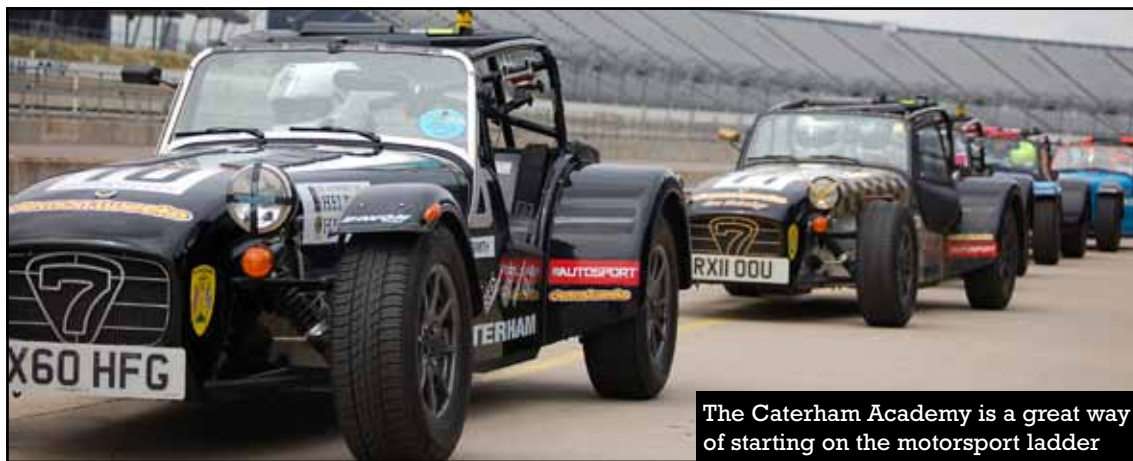
The Caterham Academy is a great way of starting on the motorsport ladder